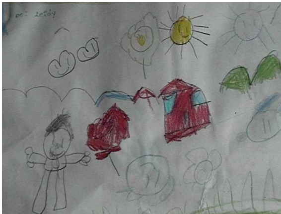
Figure 2. Mixed by a child under displacement situation. Untitled

Figure 2 shows that there are images loaded with expressive graphisms, where there are no visual element directly recognizable, a composition very rich in plasticity, movement and color, there is constant and dynamic hooking, which from its anarchy in handling the line offers richness in its visual force; color selection maintains a strong tension of harmony, when the various warm tones and the various cold tones coordinate, which is combined thanks to the contrast by the black of the ink, and white of the support. Therefore, Garcia holds that: