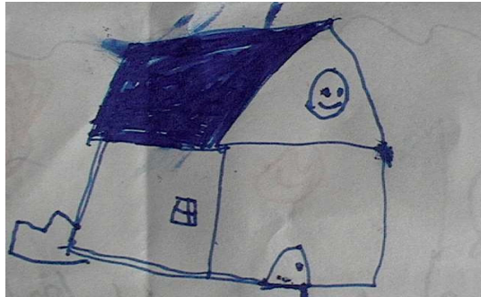
Figure 3. Mixed by a child under displacement situation. “house”

The interesting thing of this figure, is inclusion of sensation of depth, given by its redimension, it does not appear as a plane element, the window that smiles, gives the impression of being a humanized object; its small door with a safe, the lateral window, the sensation of floor and bush given by the double line, makes it to value in the drawing inclusion of details, which seems not to be proper at that age. At observing it, loneliness feels dramatic, not tragic, even, in spite of the smile of the window ... the cold color, line handling transport homesickness, not of what it was, but what it could have been. As Barthes states: