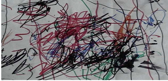
Figure 1. Mixed by a child under displacement situation. Untitled

This drawing expresses handling human figure, within a surrounding, perhaps the one related to origin place, the yellow sun, and a colorless sun, the red house and a red rose contrast to the other figures, including the human one, which is colorless, the red color as that meaningful thing which still lives, either from experience or memory, that thing that denies to remain behind; the human figure, on a first plane, draws a diagonal toward mountains, creating a depth sense as present-past relationship, as if it were the connection of one consequence of displacement, perhaps expressing a moving away, since he turns his back. Regarding it, Cuenca states that: "Reality always remains encoded, exposed to interpretation, and error by it, articulated into a game of mirrors which raises duality or ambiguousness of every sense" (Cuesta, 1999:24).