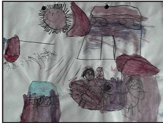
Figure 5. Mixed by a child under displacement situation. “house”

Images representing daily life denied by violence. A sun looking at other side, the moon, the house, the family united, nearing houses are the distribution given in the arrangement. Only the figure has been aquarelled, the surrounding is in blank, as something vacuum, absent, product of a context with no surrounding, the onthos in absence of a topos from which to reference, producing a sensation of uncertainty in front of that non-expected thing. Therefore, Kundera states: